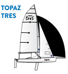
SAILS SPECIFICATION Mylar Main & Dacron Jib Sail area excl. Gennaker 8.75m2 Gennaker 8.41m2 PY1175