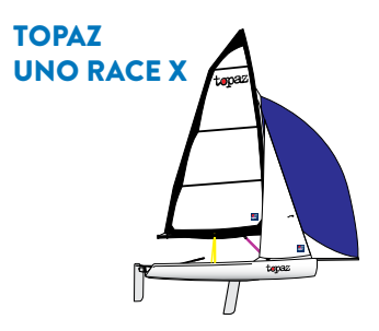
SAILS SPECIFICATION Mylar Main & Dacron Jib Sail area excl. Gennaker 8.68m2 Gennaker 8.00m2 PY 1200