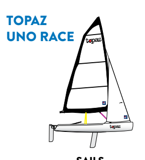
SAILS SPECIFICATION Mylar Main & Dacron Jib Sail area 8.68m2 PY 1240