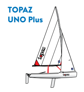
SAILS SPECIFICATION Dacron Main & Jib Sail area 7.52m2 PY 1255